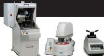
Sample Preparation Equipment