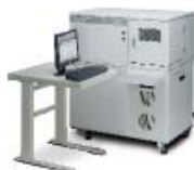
Atomic Emission Spectroscopy