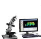
Digital Zoom Microscopes

LECO provides a complete line of instrumentation for materials characterization, including elemental analysis, atomic emission spectrometry, metallographic sample preparation, optics, image analysis and management, hardness testing, and related accessories.